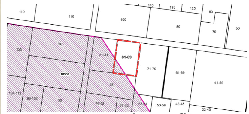
DDO - Design and Development Overlay Note: due to overlaps, some overlays may not be visible, and some colours may not match those in the legend