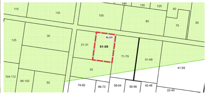
SLO - Significant Landscape Overlay Note: due to overlaps, some overlays may not be visible, and some colours may not match those in the legend

This copied document is made available for the sole purpose of enabling its consideration and review as part of a planning process under the Planning and Environment Act 1987. The document must not be used for any purpose which may breach copyright legislation