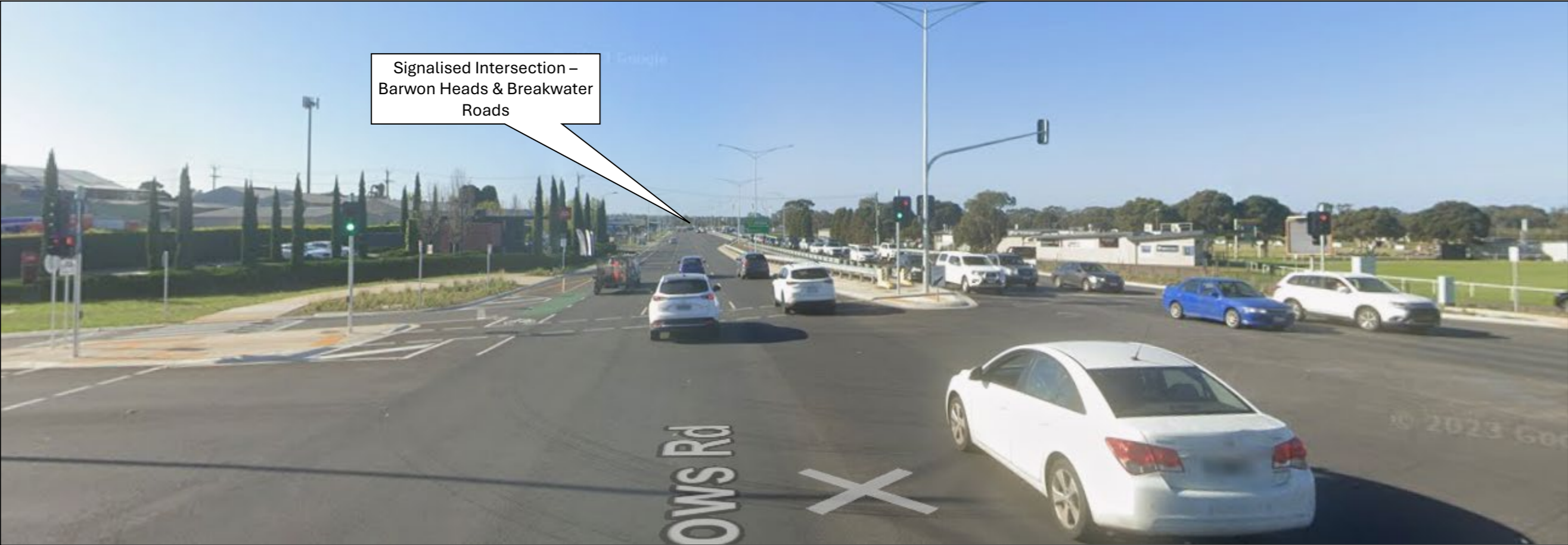
Figure 3 - Signalised Intersection – Barwon Heads and Crows Road, approximately 416 metres to south