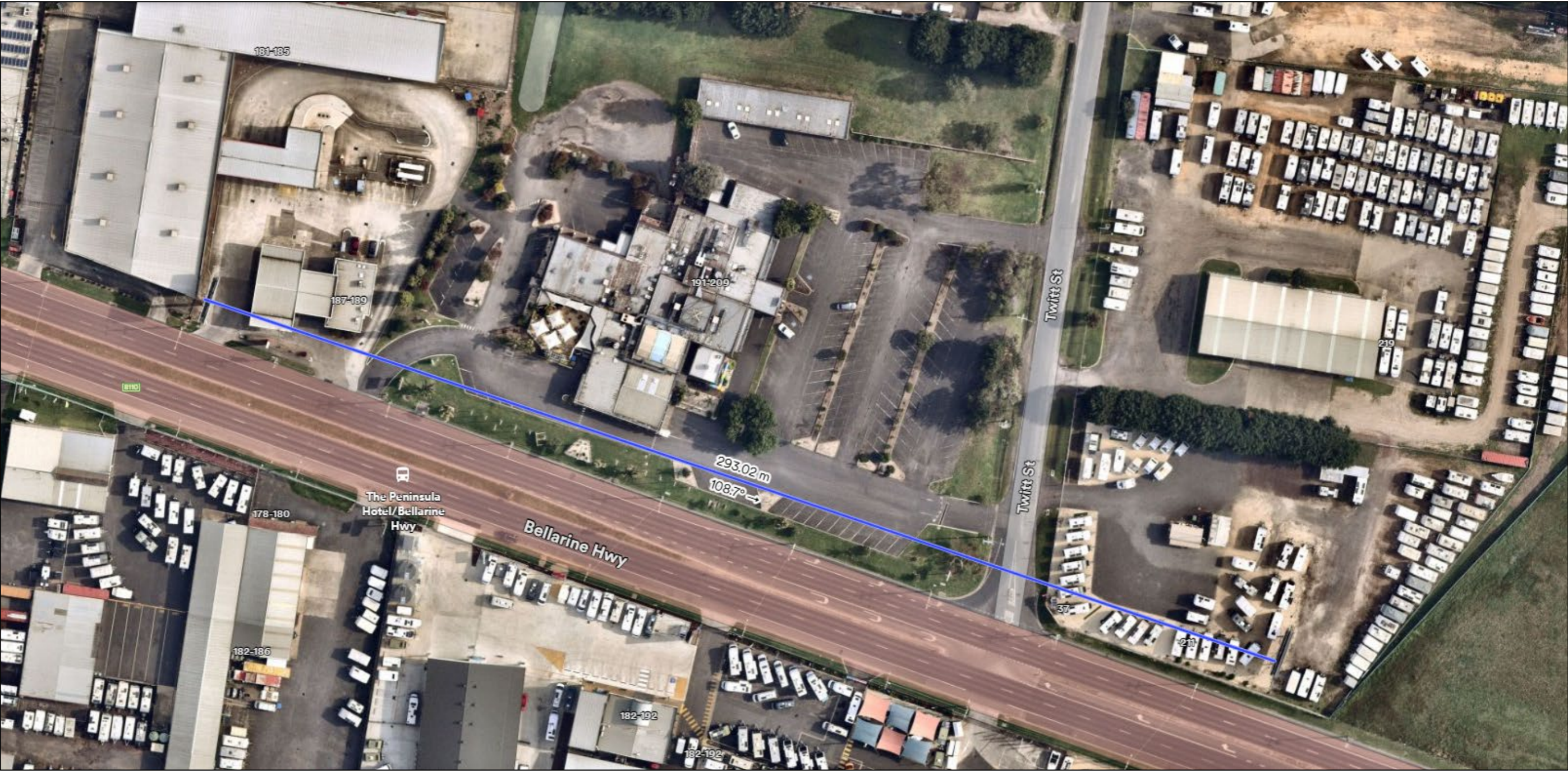
Figure 7 – Aerial – Separation distance between major promotion signs Bellarine Highway, Moolap

This copied document is made available for the sole purpose of enabling its consideration and review as part of a planning process under the Planning and Environment Act 1987. The document must not be used for any purpose which may breach copyright legislation