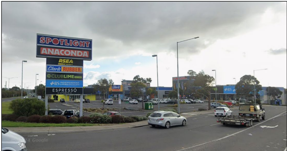
Sky Sign – Corner of Settlement and Breakwater Roads