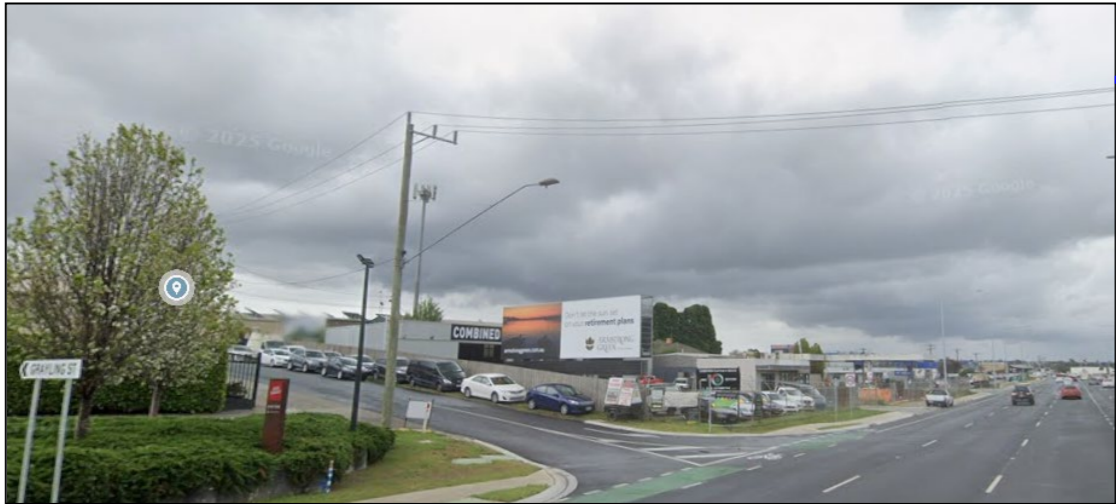
Non Electronic Promotion Sign – Corner Grayling Street and Barwon Heads Road