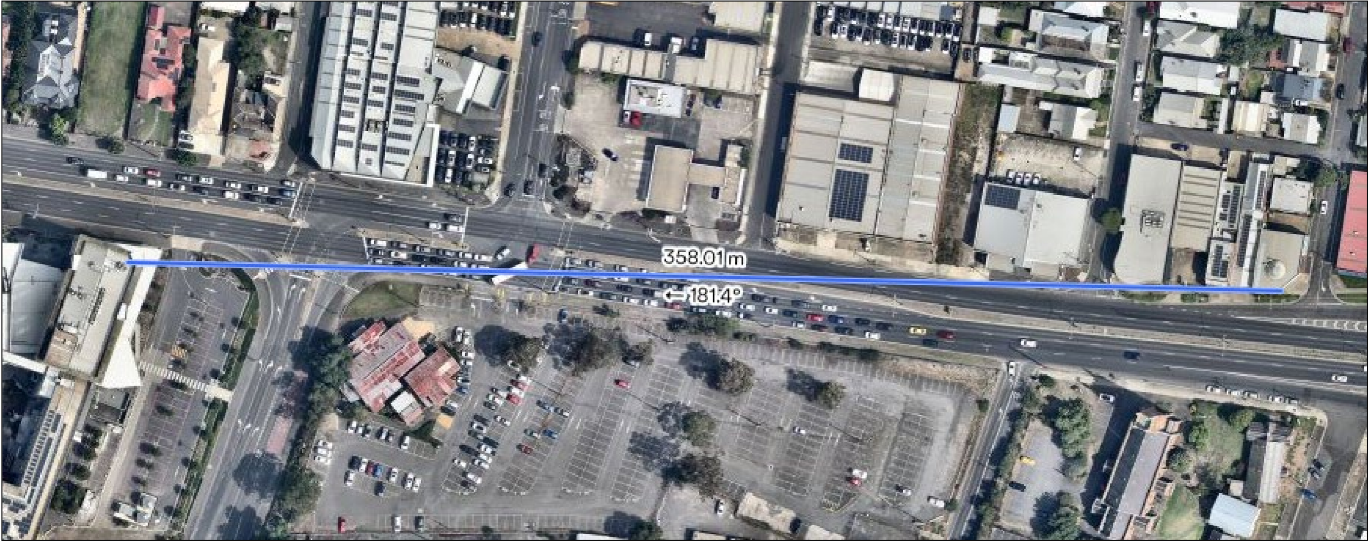
Figure 8 – Aerial – Separation distance between major promotion signs Latrobe Terrace, Geelong (one recently approved)