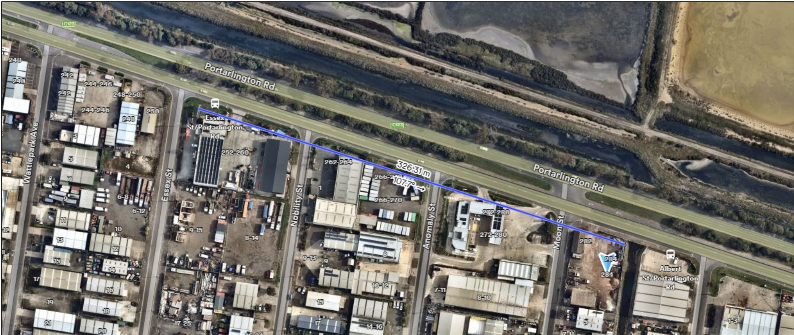
Figure 6 – Aerial – Separation distance between major promotion signs Portarlington Road, Moolap

This copied document is made available for the sole purpose of enabling its consideration and review as part of a planning process under the Planning and Environment Act 1987. The document must not be used for any purpose which may breach copyright legislation