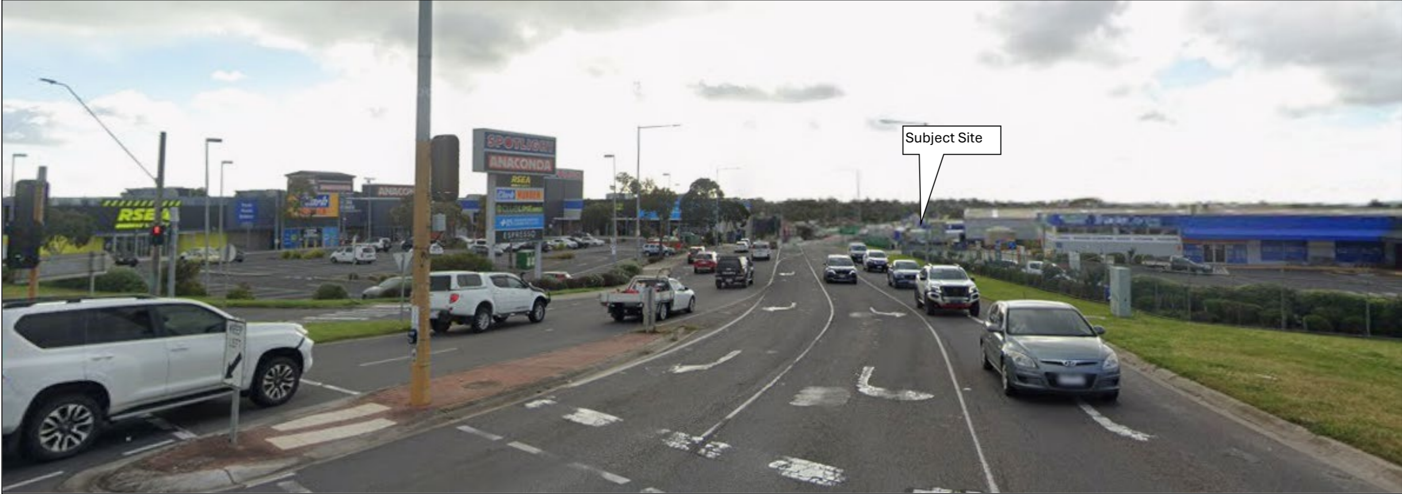
Figure 5 – Western Approach – Existing Sky Sign, Spotlight/Anaconda complex