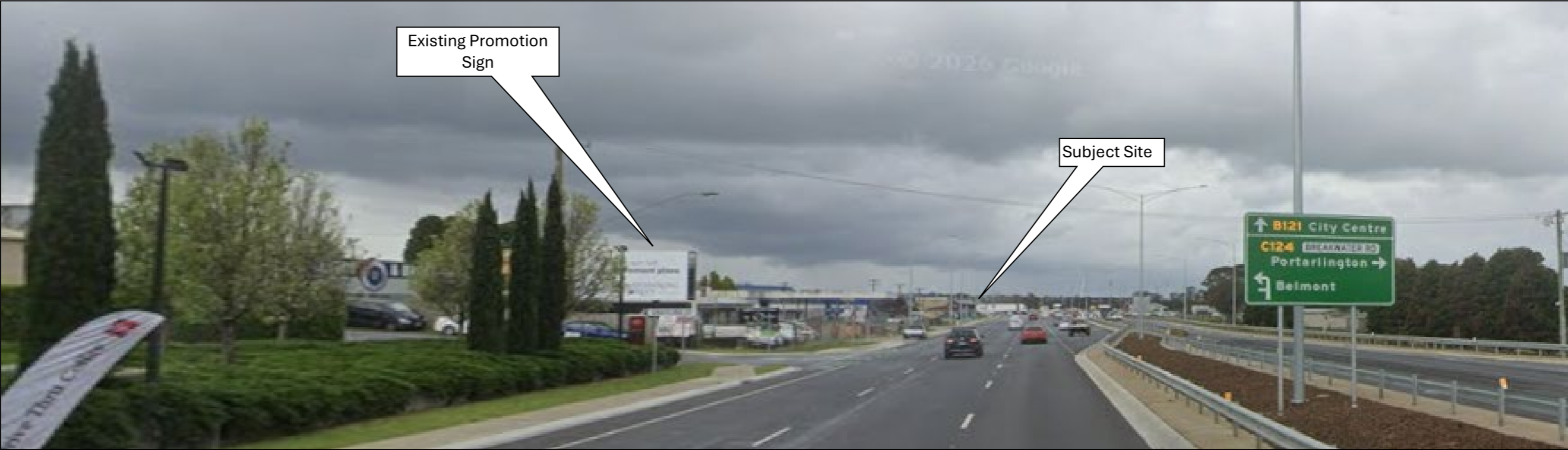
Figure 4 – Southern Approach – Northbound Traffic

This copied document is made available for the sole purpose of enabling its consideration and review as part of a planning process under the Planning and Environment Act 1987. The document must not be used for any purpose which may breach copyright legislation