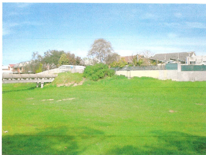
Drainage reserve & residential development adjoining to south of Stage 2B