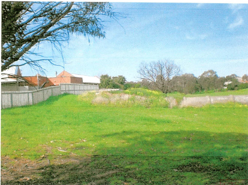
Areas to be developed as part of Stage 2B

CITY OF GREATER GEFLONG STATUTORY PLANNING 28 MAY 2013 RECEIVED