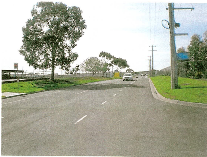
Weddell Road – view to north