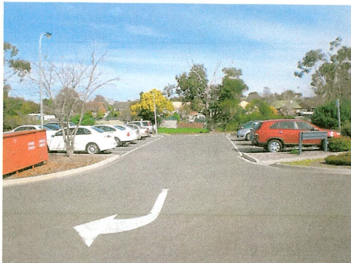
Northern “leg” of De Stefano Drive – to be incorporated into Stage 2A (Permit 1256/2012)