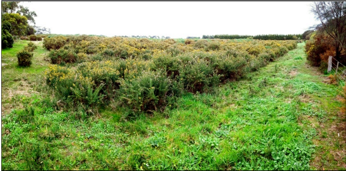
Gorse remains a serious pest plant, even in today's era of effective herbicides and powerful machinery: this panoramic view of a neglected property in the northwest section of the St. Leonards Growth Area 2 shows a Gorse infestation of approximately 30,000 square metres (3 Ha).