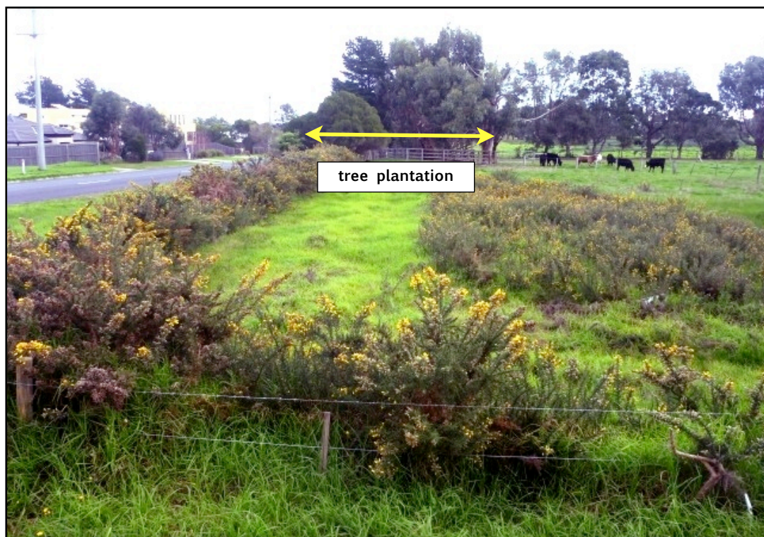
Photo taken at the southeast corner of 152-200 Bluff Road (facing west) showing a re-emerging Gorse problem along the southern boundary and in a thicket further into the paddock. The tree plantation which was established in an area of deep-ripped ground on the southern boundary in the 1980s is marked by the yellow arrow.

west became “absolutely covered” with Gorse thickets which extended “at least 100 yards” northward into the property from the southern boundary. Just prior to Graham Brown taking over the farming on the property about 25 years ago, the Gorse was bulldozed out and the ground was deep ripped to remove roots and suckers. The Gorse debris was heaped up to dry and later burned. He said that once the Gorse had been removed, the southern boundary area was re-ripped and planted with a plantation of mixed Eucalypts, with new fencing being installed on either side of the plantation.