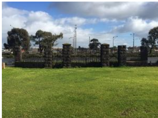
Photo 2: rear view looking west of the Osborne Park gates, North Geelong, August 2016