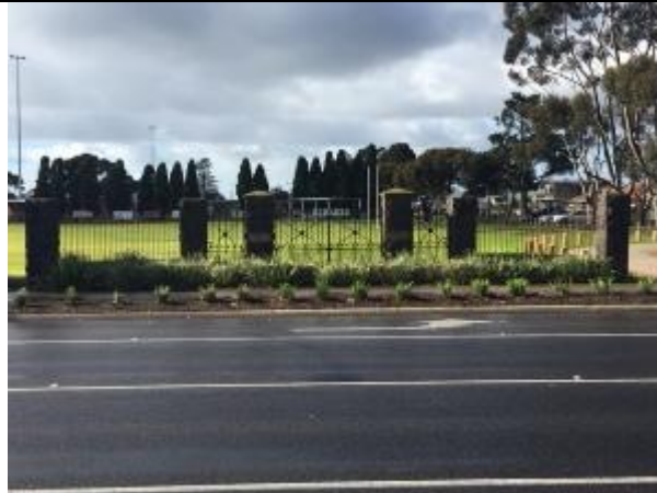
Photo 1: Osborne Park gates viewed from Melbourne Road, North Geelong, August 2016

Assessment Date: August 2016 (revised Panel hearing Am C341 December 2016)