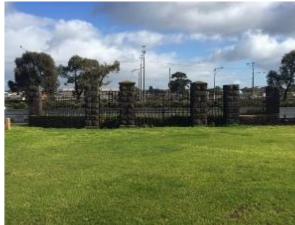
Rear view of Osborne Park gates, North Geelong August 2016

Photograph Date: August 2016/December 2015