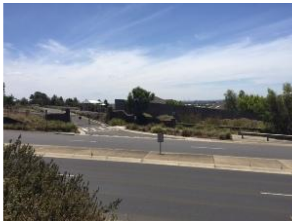
Photo 6: Morongo bluestone gates Midland Highway Bell Park Geelong Dec 2015

Other early gates that still form part of the original homestead include the bluestone block gate entrance at Kardinia International College (formerly Morongo) at Ballarat Road, Bell Post Hill. These bluestone gates were moved in 2004 by a short distance in a northerly direction as part of the scheme to widen Ballarat Road.