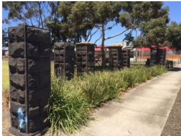
Photo 4: Osborne Park gates looking south from Melbourne Road, August 2016

Assessment Date: August 2016 (revised Panel hearing Am C341 December 2016)