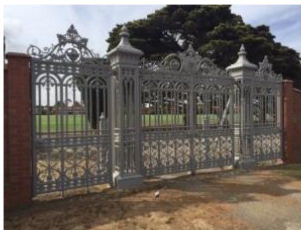
Photo 7: Lunan House wrought iron gates now located at Geelong Grammar Corio campus, Corio Dec 2015

The decorative and elaborate designed wrought iron gates at Geelong Grammar – Corio were previously located at Lunan House, Lunan Avenue, Drumcondra. These gates now front onto Foreshore Road, Corio.