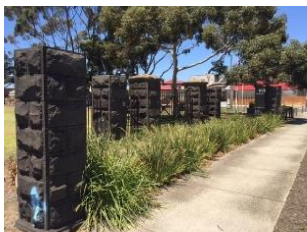
Photo 5: Osborne Park bluestone and cast/wrought iron gates at Osborne Park, North Geelong Dec 2015

In 1928-29 as part of a scheme to widen the Melbourne Road, the bluestone gates to Osborne House were relocated approximately 33ft (10 metres) north-east from their original position by the Corio