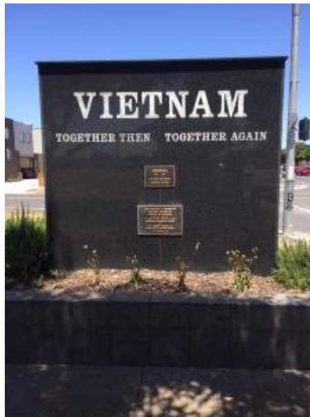
Photo 1: Vietnam Veterans memorial in Osborne Park, North Geelong Dec 2015

Assessment Date: October 2015 reviewed August 2016 (reviewed Dec 2016 Am C341 panel hearing)