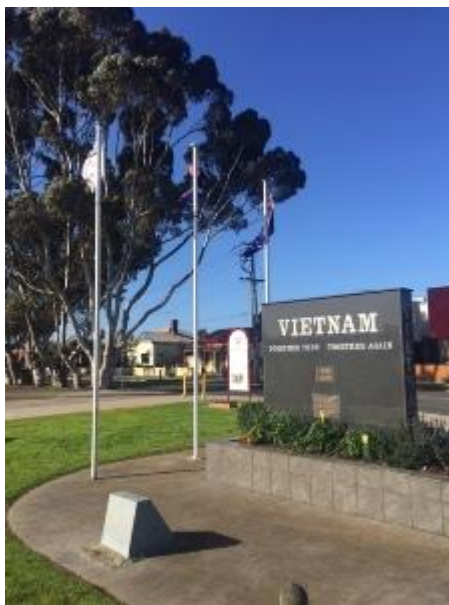
Photo 6: memorial wall, roll of honour panel, Osborne Park, North Geelong Aug 2016