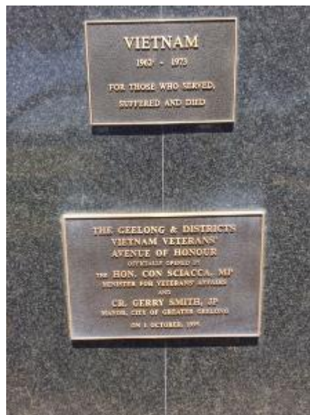
Photo 2: inscription on memorial Vietnam Veterans memorial in Osborne Park, North Geelong Dec 2015