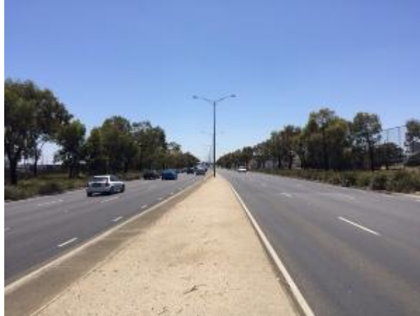
Photo 3: Avenue of Honour, looking north along Melbourne Road, North Geelong Dec 2015

Assessment Date: October 2015 reviewed August 2016 (reviewed Dec 2016 Am C341 panel hearing)