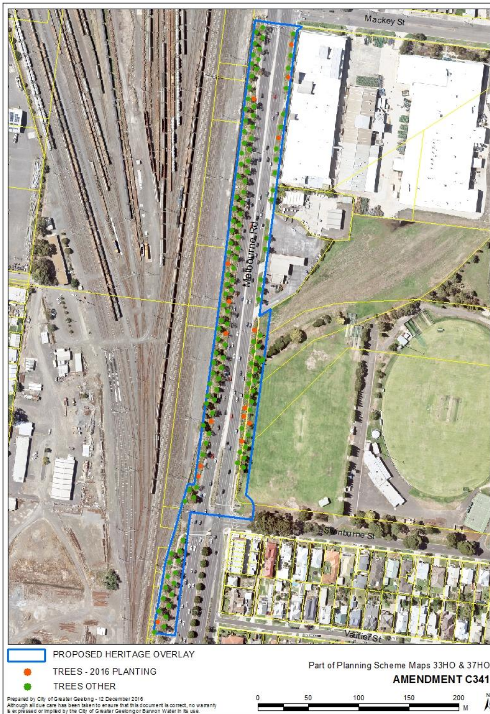
Figure 3. aerial map of tree planting within the extent of the Heritage Overlay supplied by the City of Greater Geelong, dated 12 December 2016.

Assessment Date: October 2015 reviewed August 2016 (reviewed Dec 2016 Am C341 panel hearing)