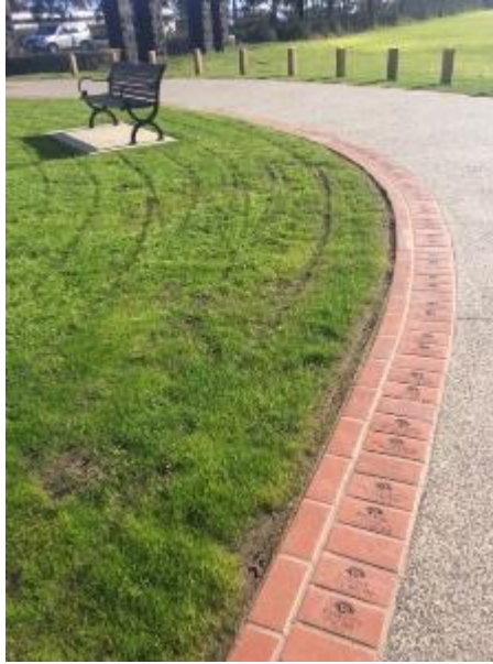
Photo 7; memorial walkway and seating looking north west in Osborne Park Aug 2016

Assessment Date: October 2015 reviewed August 2016 (reviewed Dec 2016 Am C341 panel hearing)