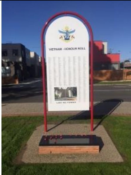
Photo 5: roll of honour panel and poppy holder, looking south, Aug 2016

Assessment Date: October 2015 reviewed August 2016 (reviewed Dec 2016 Am C341 panel hearing)