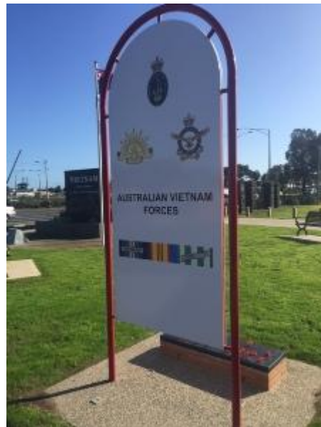
Photo 4: roll of honour panel looking north/west in Osborne Park, Aug 2016