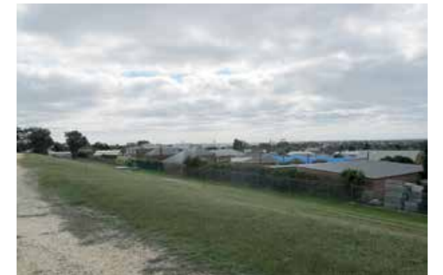
3 EASTERN RESIDENTIAL INTERFACE