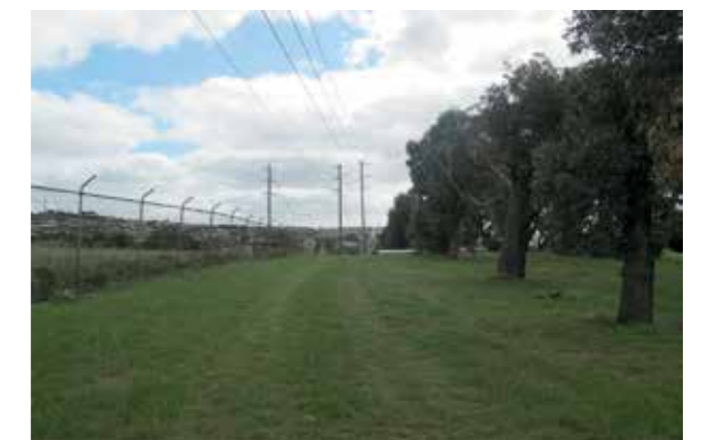
4 PIPE RESERVE INTERFACE

Site Analysis 122A Thornhill Road, Highton