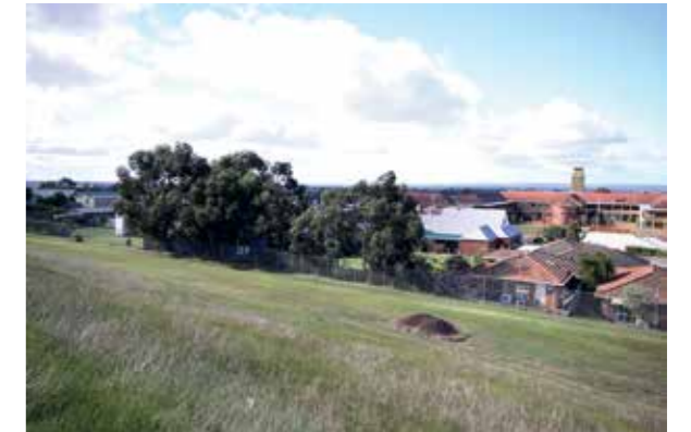
2 EASTERN RESIDENTIAL INTERFACE