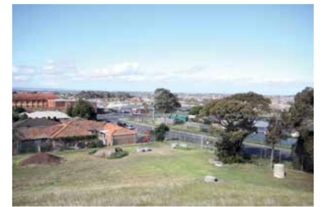
1 THORNHILL ROAD INTERFACE