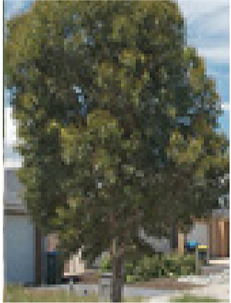
Eucalyptus leucoxylon ssp. Connata