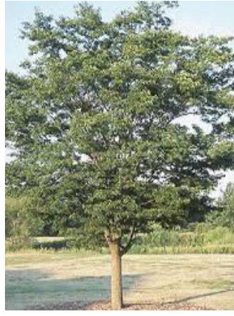
Zelkova serrata 'Green Vase'