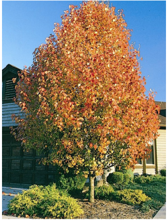
Pyrus calleryana 'Aristocrat'