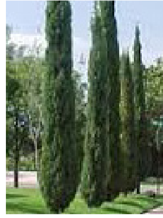
Cupressus sempervirens 'Glauca'