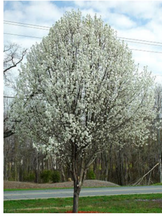
Pyrus calleryana 'Brugundy Snow'