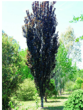
Prunus cerasifera 'Crimson Spire'