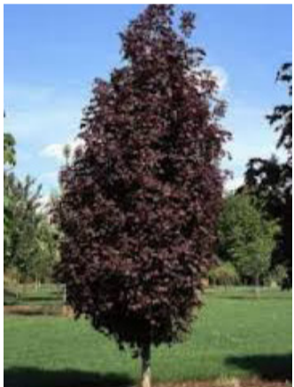
Acer platinoides 'Crimson Sentry'