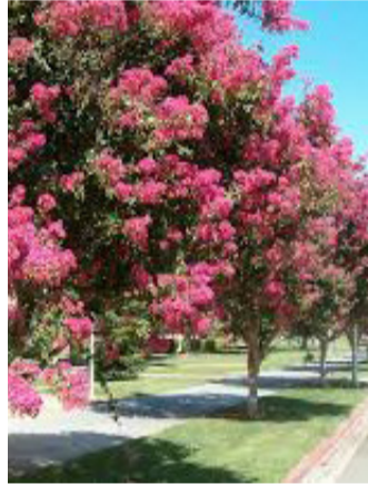
Eucalyptus leucoxylon 'Euky Dwarf'