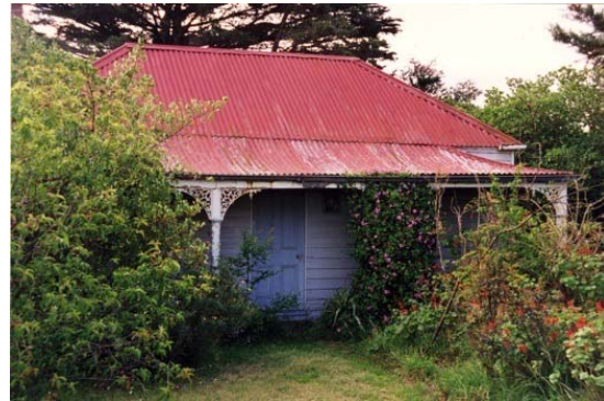
Figure 5: Hurley House, 1998.