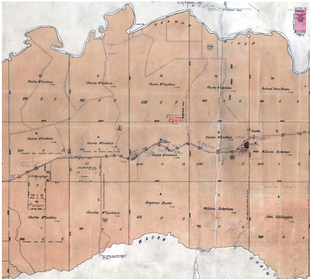
Figure 1: Part Barrabool Parish Plan, Dept of Lands & Survey, Melbourne, March 1946, showing land sections in the Barrabool Hills, including Ceres.