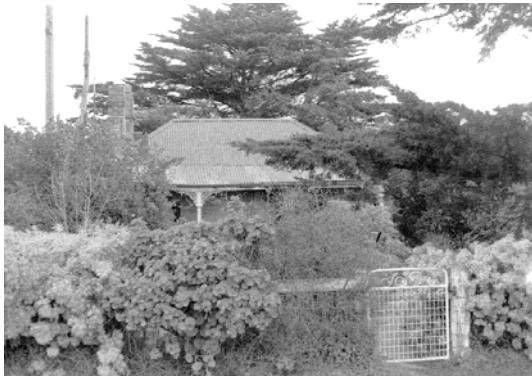
Figure 4: Hurley House, 1997.

By 1970, additions had been constructed on the north side of the rear gabled wing. 77 By the 1990s the garden surrounding the dwelling had overgrown (Figures 4-5). Between 2012 and 2016, it was removed and replaced, and repairs appear to have been made to the original dwelling, including painting and upgrades to the front verandah. Mature trees surrounding the dwelling were also removed at this time. 78