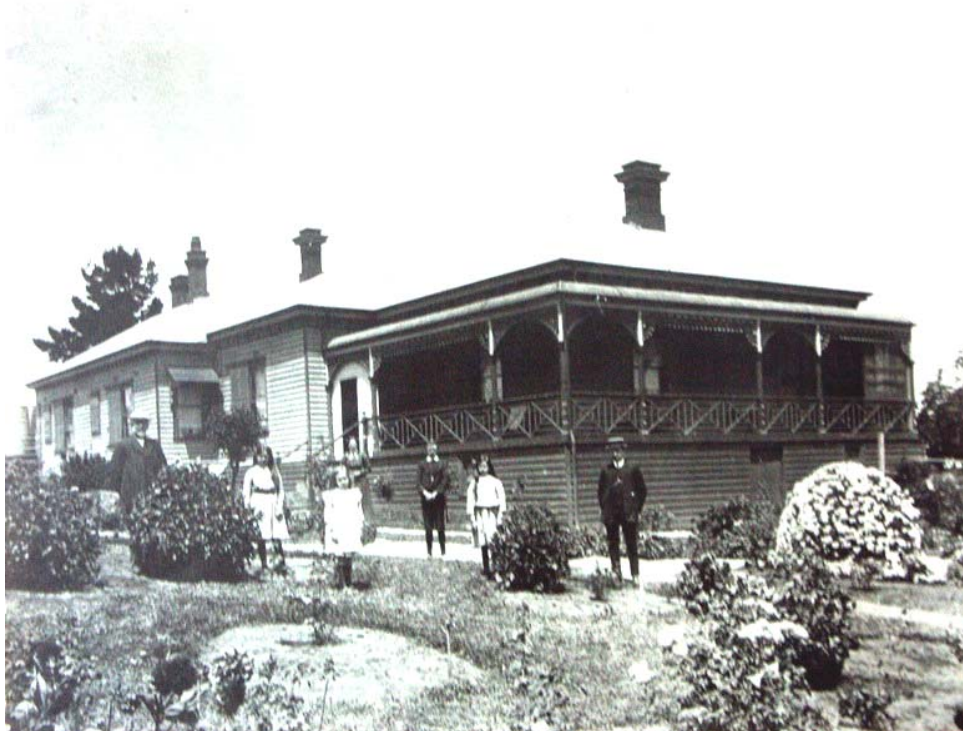
Figure 6: 'Thornbury Grange', Highton, c.1915.