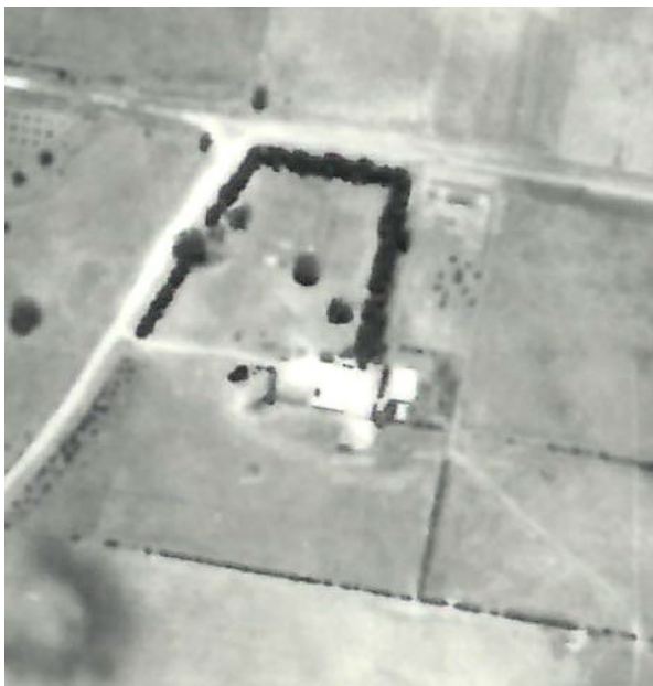
Figure 3: Aerial image of 'Erinvale' 1947. The dwelling is in the lower left corner.