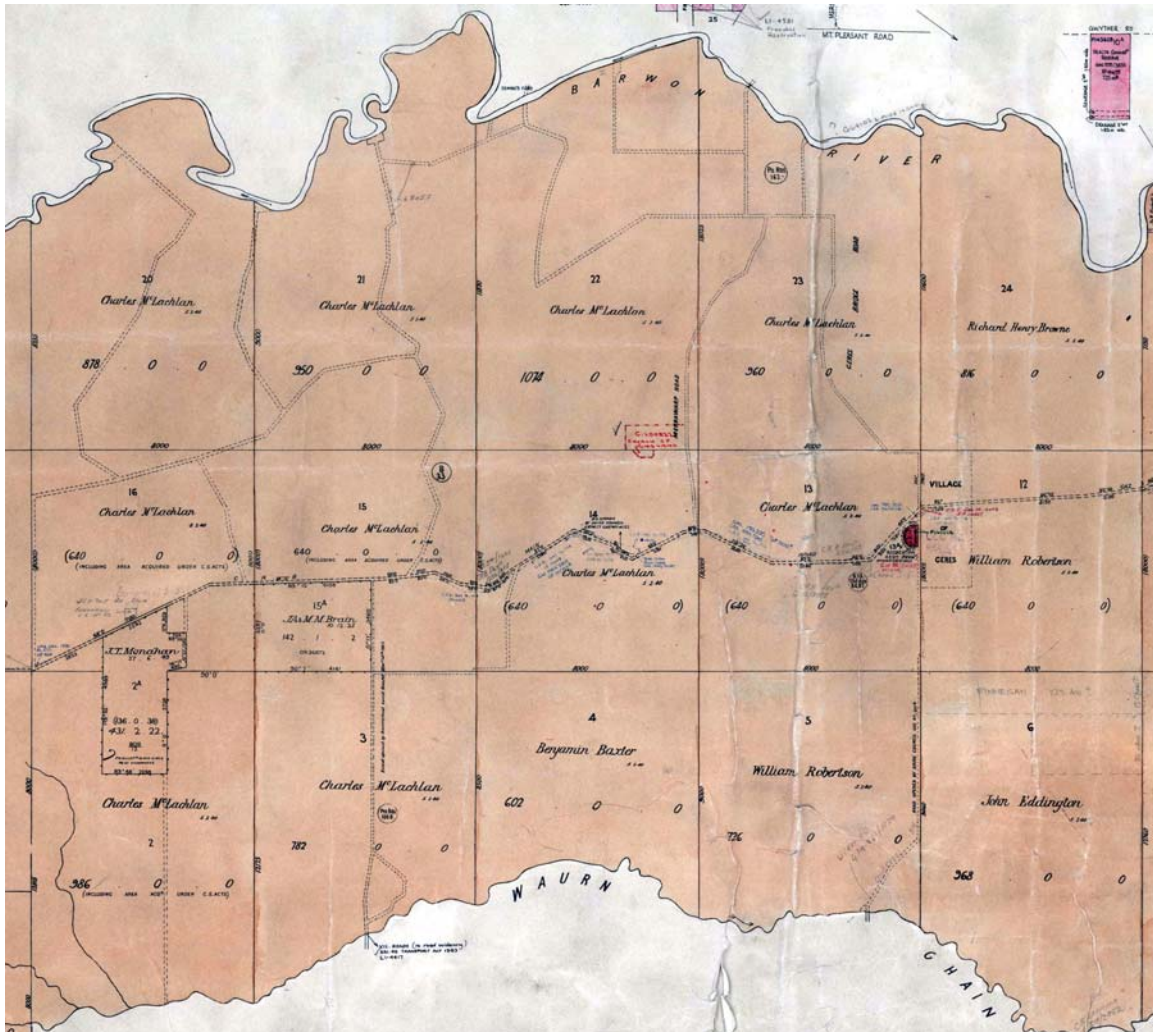
Figure 1: Part Barrabool Parish Plan, Dept of Lands & Survey, Melbourne, March 1946, showing land sections in the Barrabool Hills, including Ceres.

Hills was acquired by Charles McLachlan, a wealthy Scottish businessman of Tasmania, and his business partner, Captain Charles Swanston, English banker and merchant of Tasmania and member of the Port Phillip Association (Figure 1) 9 who purchased Sections 2-3, 13-16, and 20-23 as his vast 4,480 acre Strathlachlan sheep estate. 10 In 1850, Sections 22 and 23 and parts of Sections 13 and 14 of the Strathlachlan Estate (Barrabool Parish) were subdivided into 65 farms centred on a village of 45 building sites as the Merrawarp Estate. 11 At this time, the Barrabool Hills were considered to be the 'granary of the colony,' 12 the location of sheep grazing, growing crops, and vineyards.