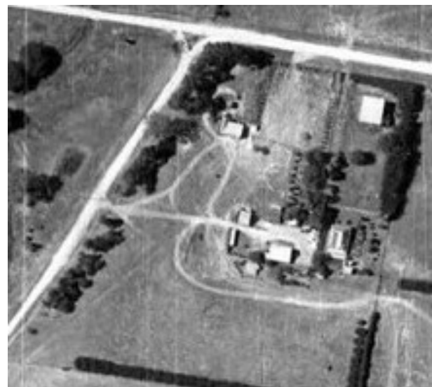
Figure 4: Aerial image of 'Erinvale', 1970. The dwelling is in on the left.

The property was subdivided into two lots in 1971, the 'Erinvale' dwelling being located on lot 1 comprising 8 acres, 1 rood and 28 perches. 45 'Erinvale' appears to have been purchased by Frank Hill by this time and it formed part of his Estate on his death in 1979. 46 By 1997, it appears that the original windows at the front and east side had been replaced and works were being carried out to the east side of the verandah (Figure 5).