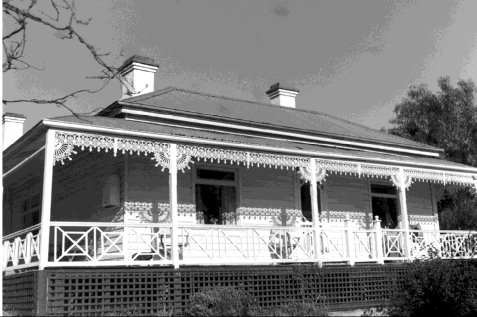
Figure 5: 'Erinvale', 285 Gully Road, 1997.