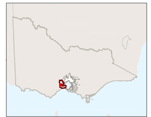
Part of Planning Scheme Maps 25 & 32