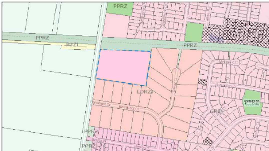
Proposed Zoning - GRZ1