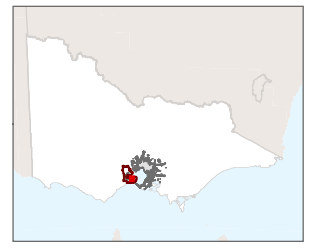
Part of Planning Scheme Map 59

Disclaimer This publication may be of assistance to you but the State of Victoria and its employees do not guarantee that the publication is without flaw of any kind or is wholly appropriate for your particular purposes and therefore disclaims all liability for any error, loss or other consequence which may arise from you relying on any information in this publication.