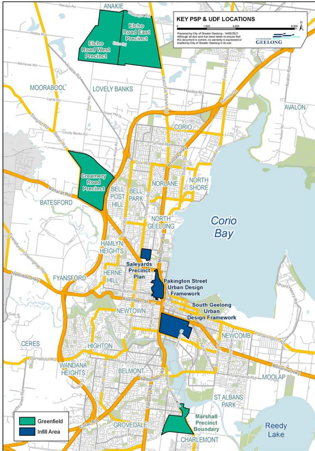
FIGURE 1: INFILL AREAS AND OTHER GROWTH PRECINCTS