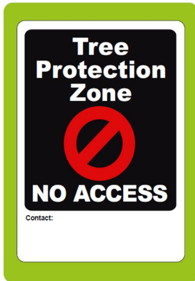
FIGURE C1 TREE PROTECTION ZONE SIGN

A TPZ sign provides clear and readily accessible information to indicate that a TPZ has been established. Figure C1 provides an example of a suitable sign.