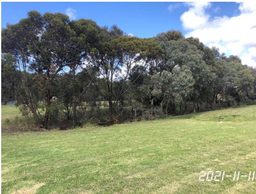
Plate 4. Planted exotic and non-native vegetation, typical conditions.