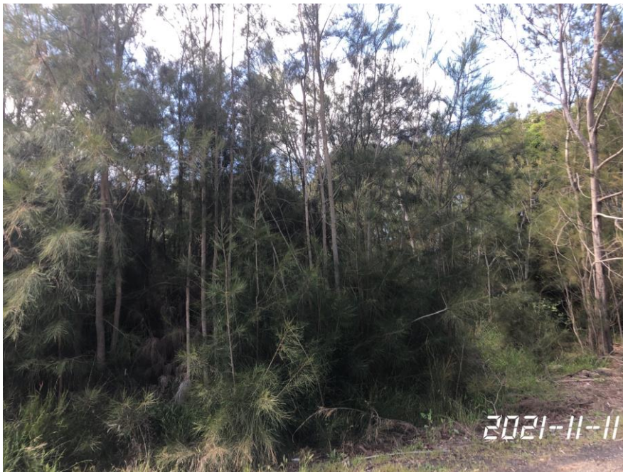
Plate 1. Planted exotic and non-native vegetation, typical conditions.