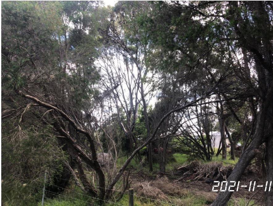
Plate 3. Planted exotic and non-native vegetation, typical conditions.