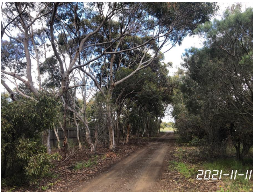
Plate 2. Planted exotic and non-native vegetation, typical conditions.