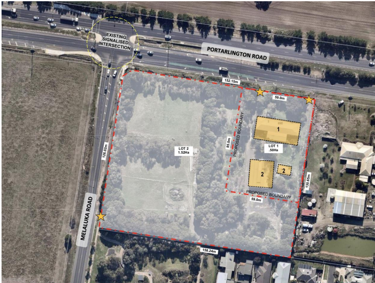
Figure 1. Study area. 672-690 Portarlington Road Leopold (proposed Lot 2).