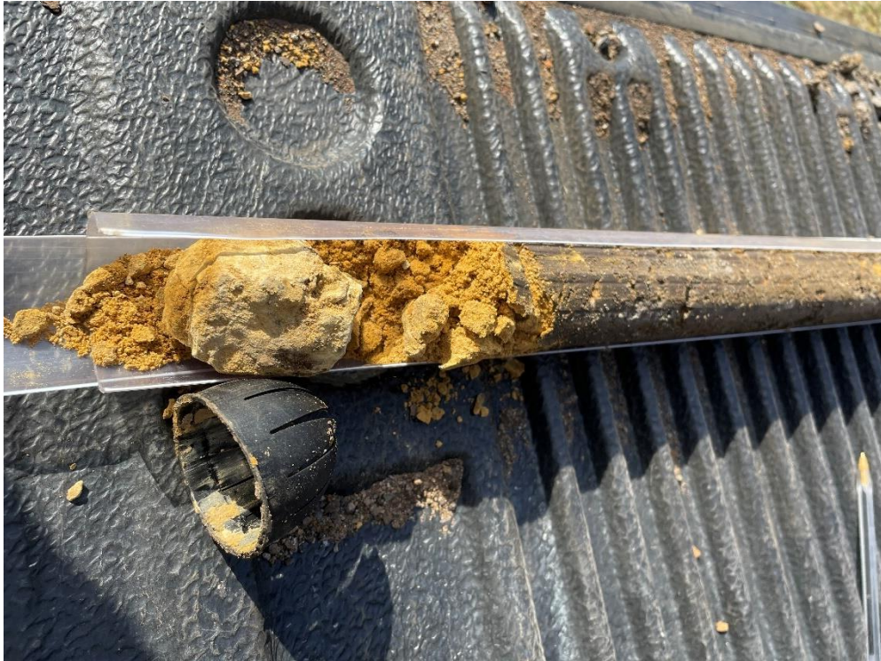
Photograph 9: Sandy clay, Yellow, BH07.