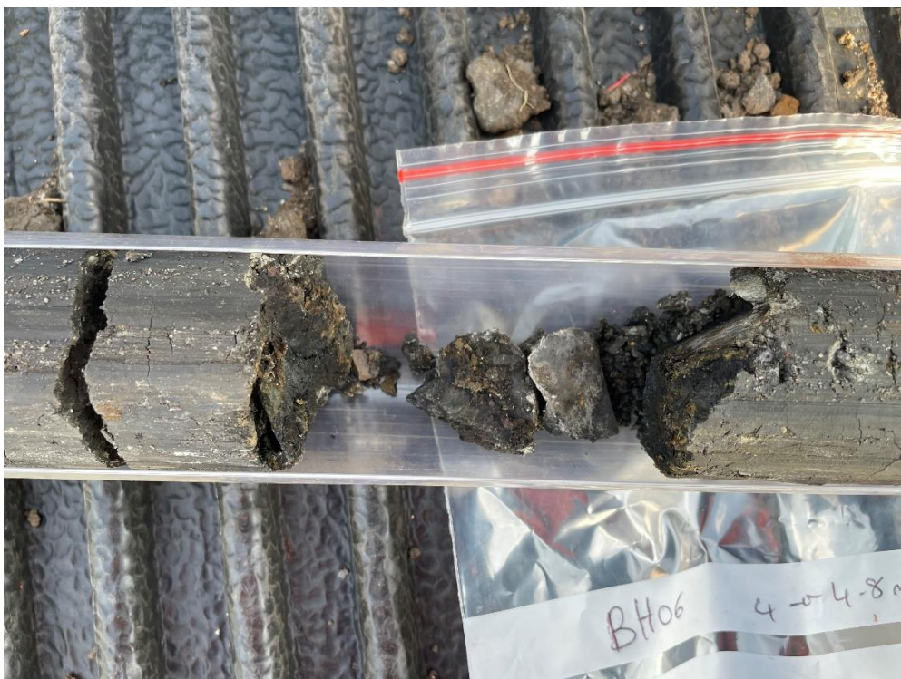
Photograph 12: Assumed asbestos-containing fibro-cement sheet, BH06.