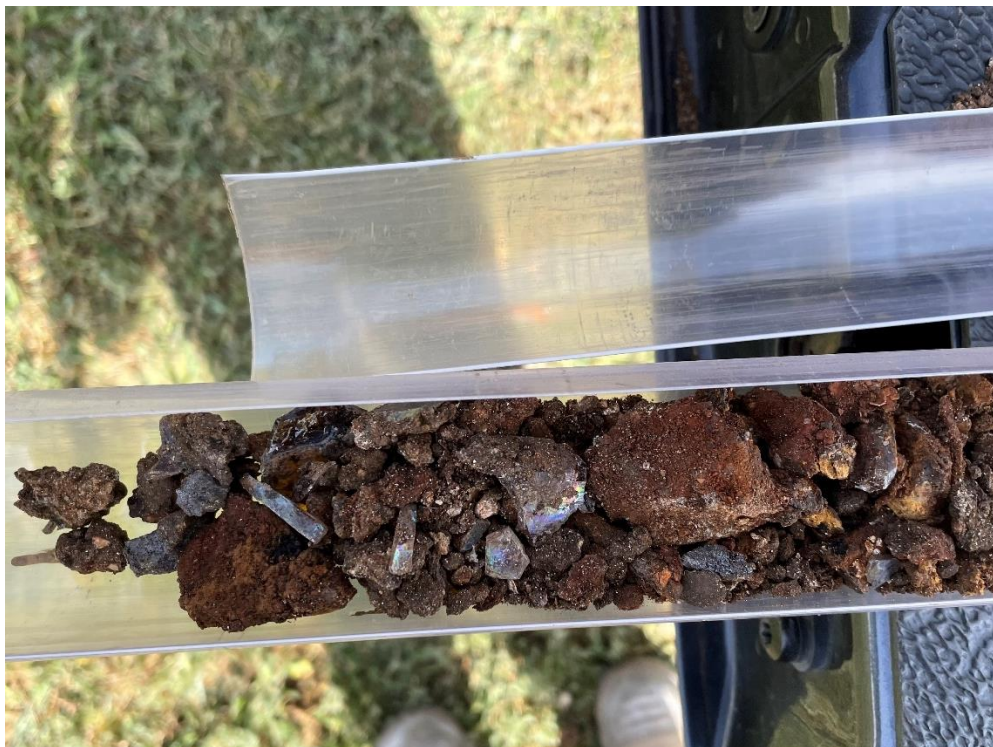
Photograph 6: Material suspected to be from the landfill cell, BH06.