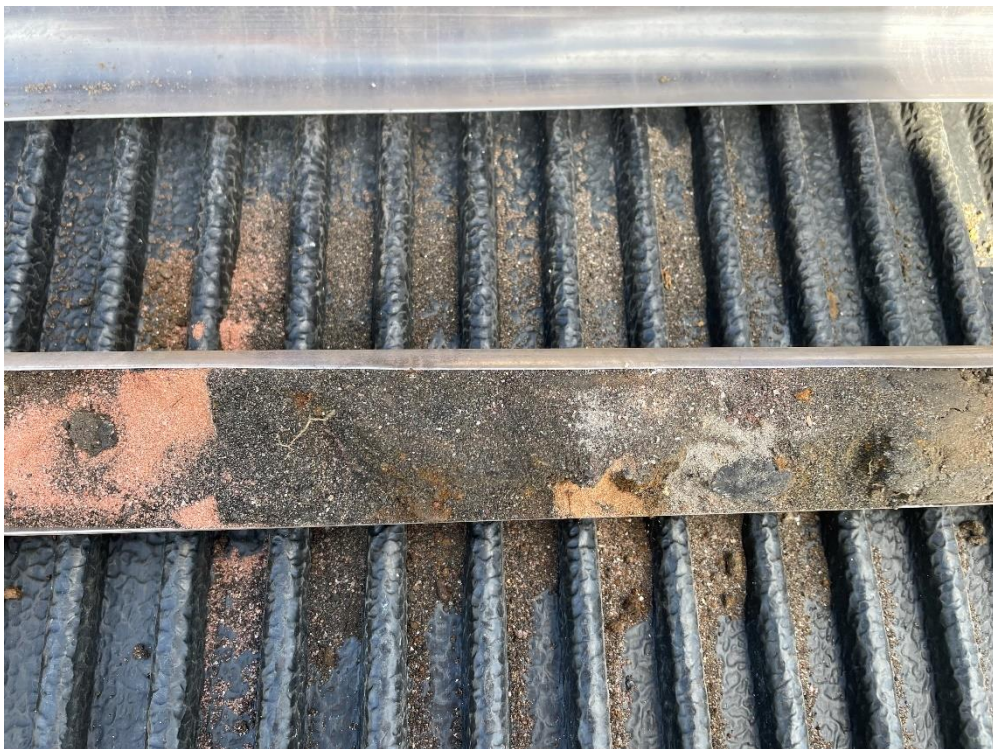
Photograph 4: Black sands, BH01.