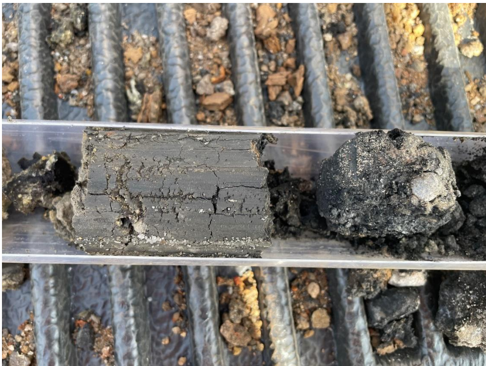
Photograph 8: Clay, Black, Hydrocarbon like odour, BH06.