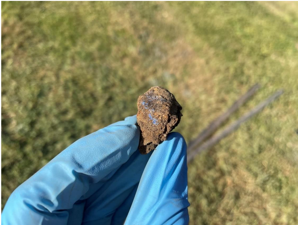
Photograph 7: Blue staining observed to soil clod within suspected landfill of BH08.