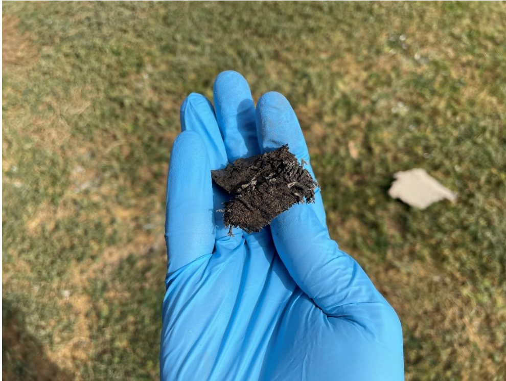
Photograph 13: Non asbestos-containing woven textile, BH09.