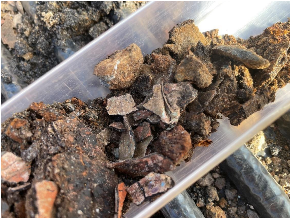
Photograph 11: Non asbestos-containing black malleable bituminous material, BH05.