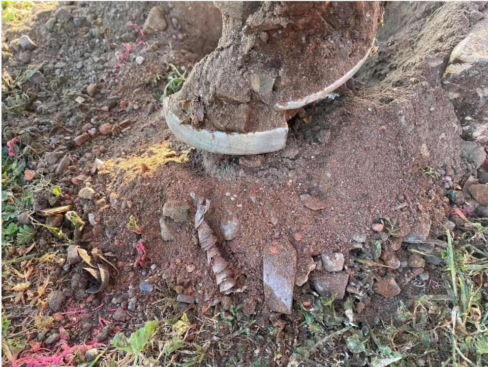
Photograph 1: Surface domain, Silt, Brown, Inert debris, BH10.