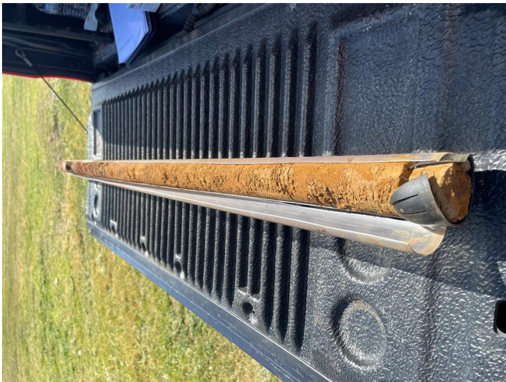
Photograph 10: Assumed Natural: Clay, Yellow.