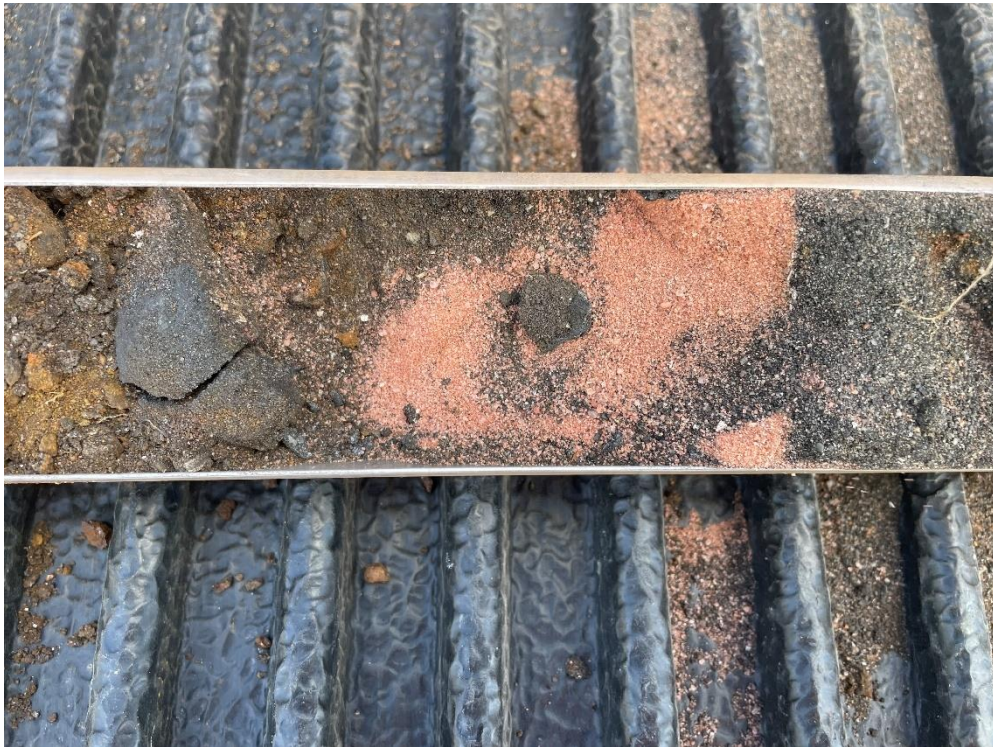
Photograph 3: Red sands, BH01.