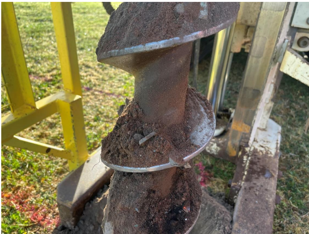
Photograph 14: Assumed asbestos-containing fibro-cement sheet debris, BH10.