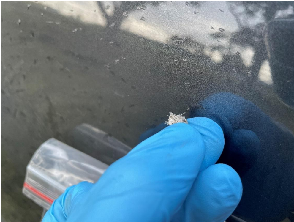
Photograph 15: Friable asbestos-containing cement product, BH16.