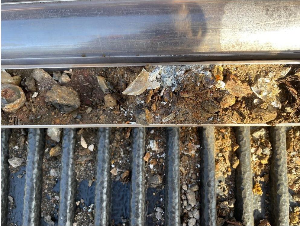
Photograph 5: Material suspected to be from the landfill cell, BH05.